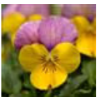
Yellow Pink Jump Up