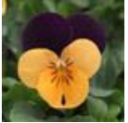
Orange Jump Up Improved