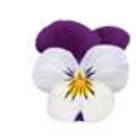
White Jump Up