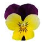
Yellow Jump Up