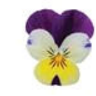
Lemon Jump Up