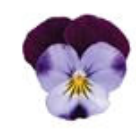
Denim Jump Up