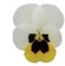
Lemon Ice Blotch