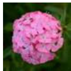
Deep Pink Maxine