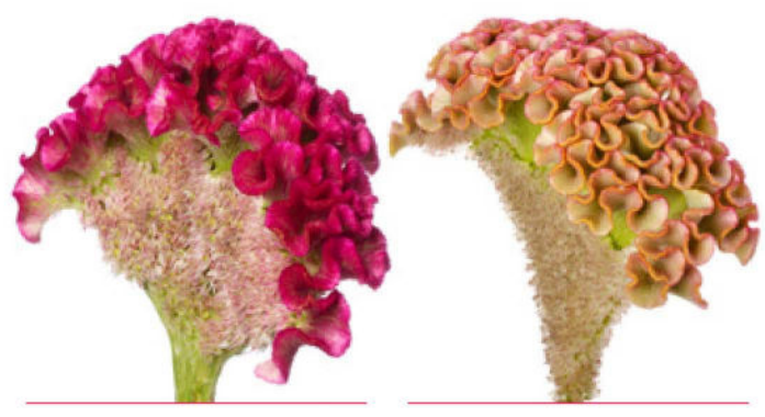
Bar Bora (Purple)