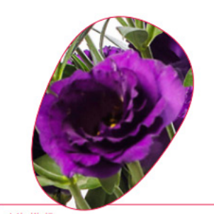
Minilisi<sup>®</sup> Blue Double II

Great value comes in small packages... Lisianthus Minilisi® is a surprising series with a colourful spectrum of very rich, smallflowered varieties. Each branch offers a well-filled cluster of flowers and buds. The smaller flower size is well compensated by the abundance of flowers and buds. There is certainly no lack of colour! Besides the great flowering power, the flowers themselves are very strong and the varieties are highly uniform. Minilisi® is a group II Lisianthus series. Discover all single and double flowered varieties of the Minilisi® series.