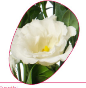
Evanthi White Wink III