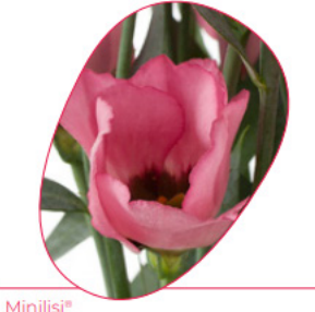
Rose Single II