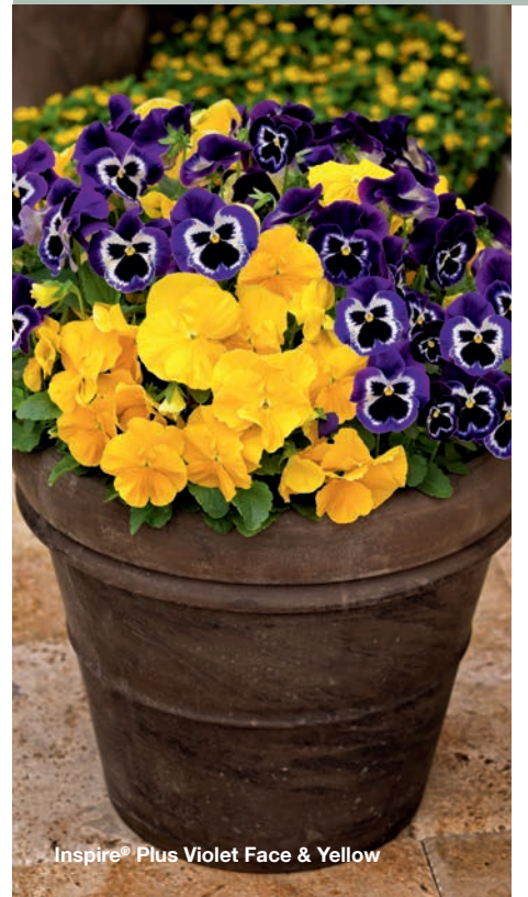
Inspire® Plus Violet Face & Yellow

Most advanced breeding in large-flowered pansies