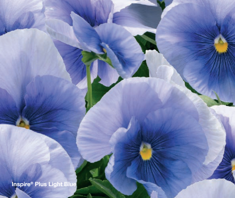
Inspire® Plus Light Blue