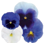
Summer Skies Mix