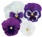
Blueberry Pie Mix