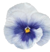
Metallic Blue Blotch