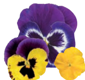
Mardi Gras Mix