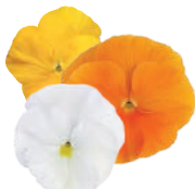
Sunny Day Mix