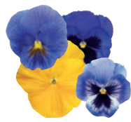
Sun 'n Surf Mix