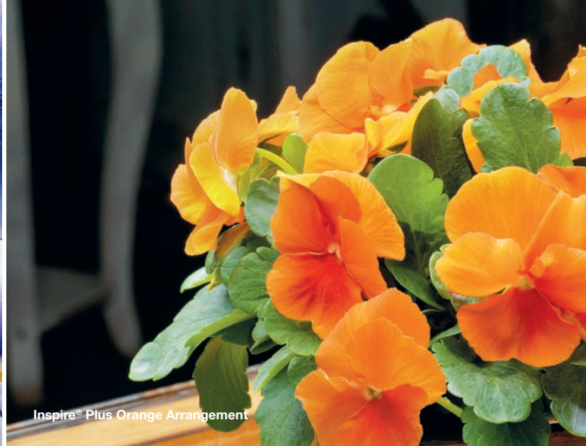
Inspire® Plus Orange Arrangement