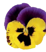
Yellow Purple Wing