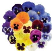
Maxi Mix (incl. all colors)