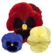
Wine Country Mix